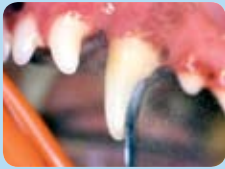
Removing the calculus using an ultrasonic scaler, followed by polishing the teeth is a very effective form of treatment

A healthy mouth typically has bright white teeth and shrimp pink (or sometimes pigmented) gums. However plaque bacteria are constantly accumulating on the surface of their teeth and will, in time, lead to inflammation of the gums – a condition called gingivitis . Affected gums are more reddened in appearance, and these changes may also be associated with localised mineralisation of the plaque to form calculus (tartar) – see picture (b).